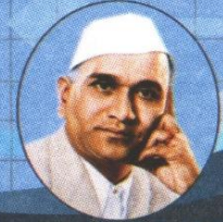
Karmaveer Bhausaheb Hiray